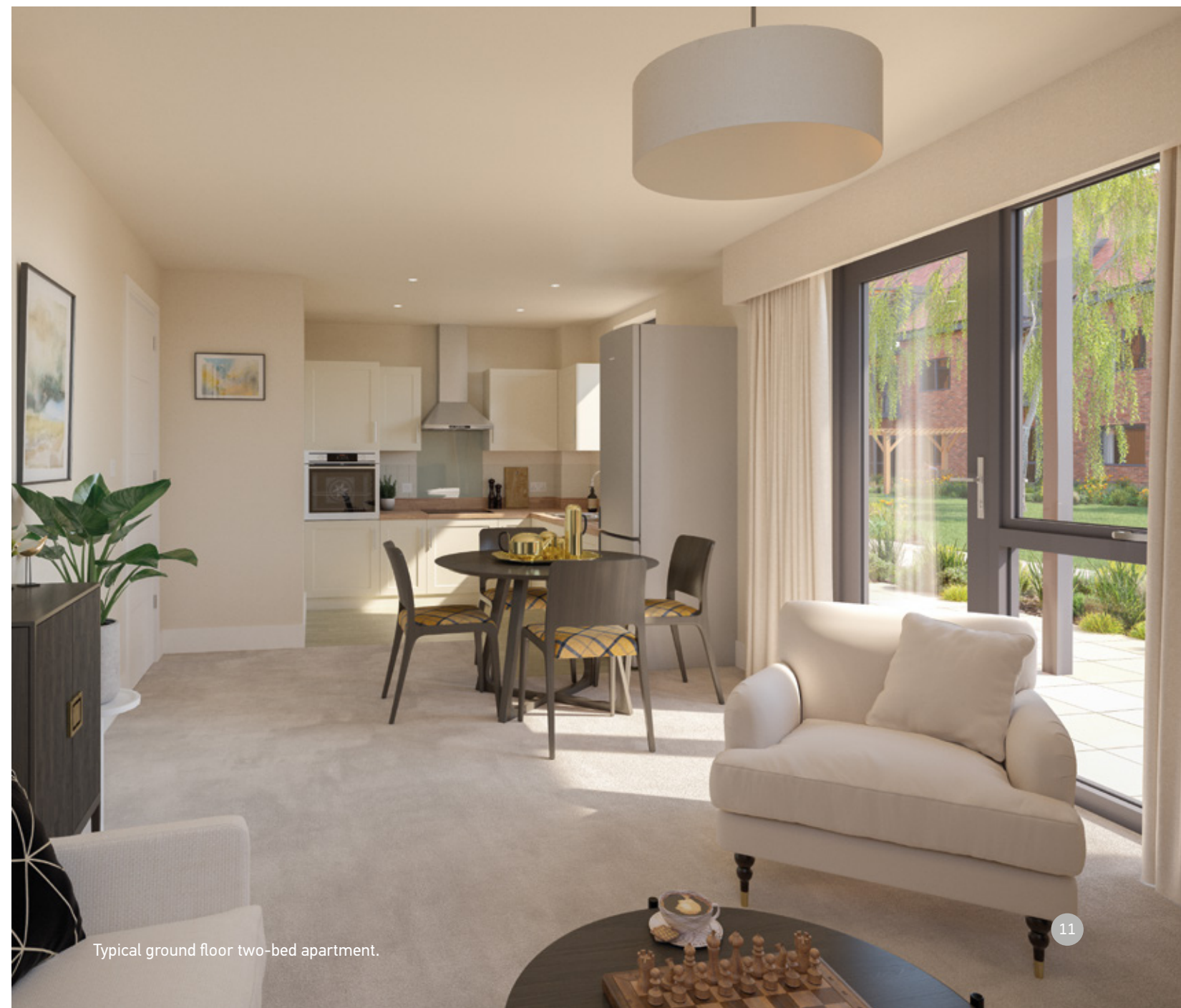
Typical ground floor two-bed apartment.

The bigger the share you buy, the lower the rent you pay — and the more of your home you own.