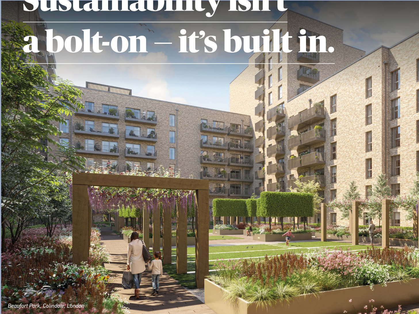
Beaufort Park, Colindale, London