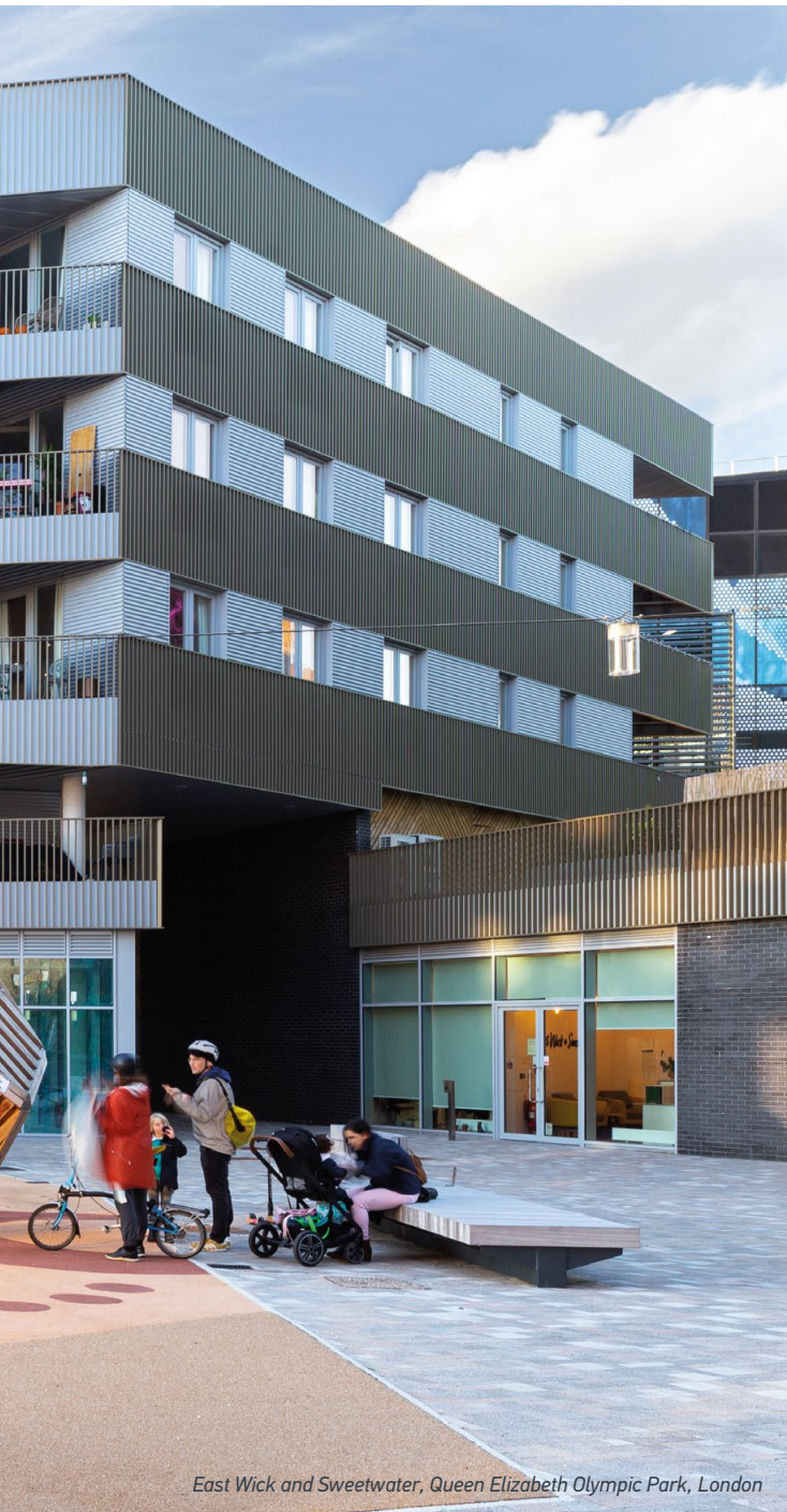
East Wick and Sweetwater, Queen Elizabeth Olympic Park, London